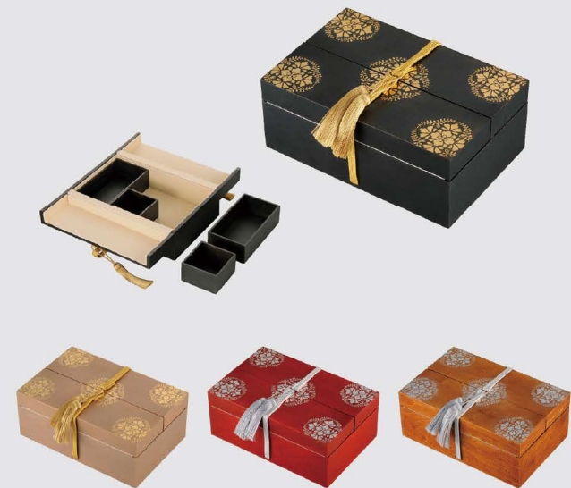
BW20-01W Tea Set Container W.166 D.256 H.100 Material: wood, natural lacquer Color: (Gold powder MAKI-E) WH, BK (Silver powder MAKI-E) R, BR