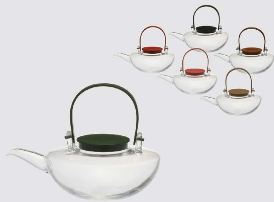
BW13-1U Choshi Tea & Sake Pot (HANANURI) W.190 D.142 H.148 Material: Body/heatproof glass Lid/wood, natural lacquer Handle/bamboo, natural lacquer Color: WH, BK, R, BR, PI, GR, NA