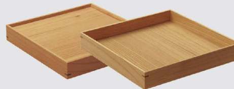
BW13-3 Chabako Extension W.198 D.198 H.31 Material: wood, natural lacquer Color: WH