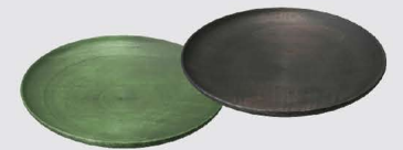
BW08-16U Plate (HANANURI) φ.145 H.20 Material: wood, natural lacquer Color: WH, BK, R, BR, PI, GR, NA