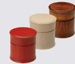
BW09-5U Canister (HANANURI) φ.75 H.85 Material: wood, natural lacquer Color: WH, BK, R, BR