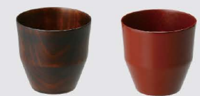
BW09-7U Cup B (HANANURI) φ.65 H.64 Material: wood, natural lacquer Color: WH, BK, R, BR, PI, GR, NA