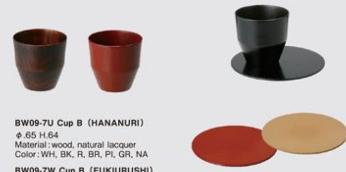
BW09-7U Cup B (HANANURI) φ.65 H.64 Material: wood, natural lacquer Color: WH, BK, R, BR, PI, GR, NA BW09-7W Cup B (FUKIURUSHI)