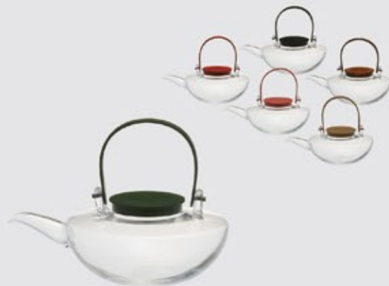
BW13-1U Choshi Tea & Sake Pot (HANANURI) W.190 D.142 H.148 Material: Body/heatproof glass Lid/wood, natural lacquer Handle/bamboo, natural lacquer Color: WH, BK, R, BR, PI, GR, NA BW13-1W Choshi Tea & Sake Pot (FUKIURUSHI)