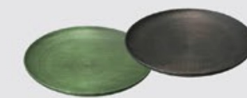
BW08-16U Plate (HANANURI) φ.145 H.20 Material: wood, natural lacquer Color: WH, BK, R, BR, PI, GR, NA BW08-16W Plate (FUKIURUSHI)