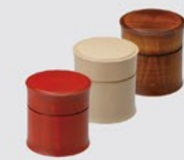
BW09-5U Canister (HANANURI) φ.75 H.85 Material: wood, natural lacquer Color: WH, BK, R, BR BW09-5W Canister (FUKIURUSHI)