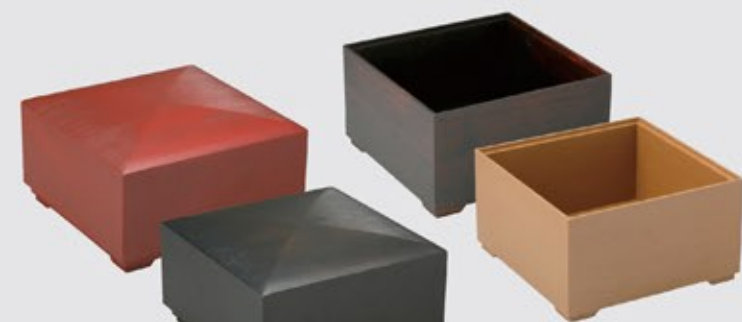
BW09-2W Kabuse (for Chabako) W.206 D.206 H.115 Material: wood, natural lacquer Color: WH, BK, R, BR, NT