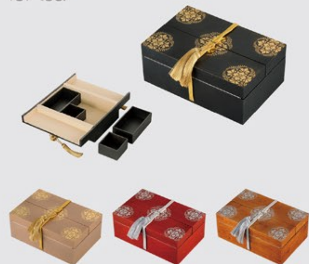
BW20-01W Tea Set Container W.166 D.256 H.100 Material: wood, natural lacquer Color: (Gold powder MAKI-E) WH, BK (Silver powder MAKI-E) R, BR