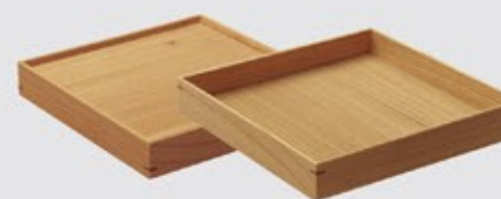
BW13-3 Chabako Extension W.198 D.198 H.31 Material: wood, natural lacquer Color: WH